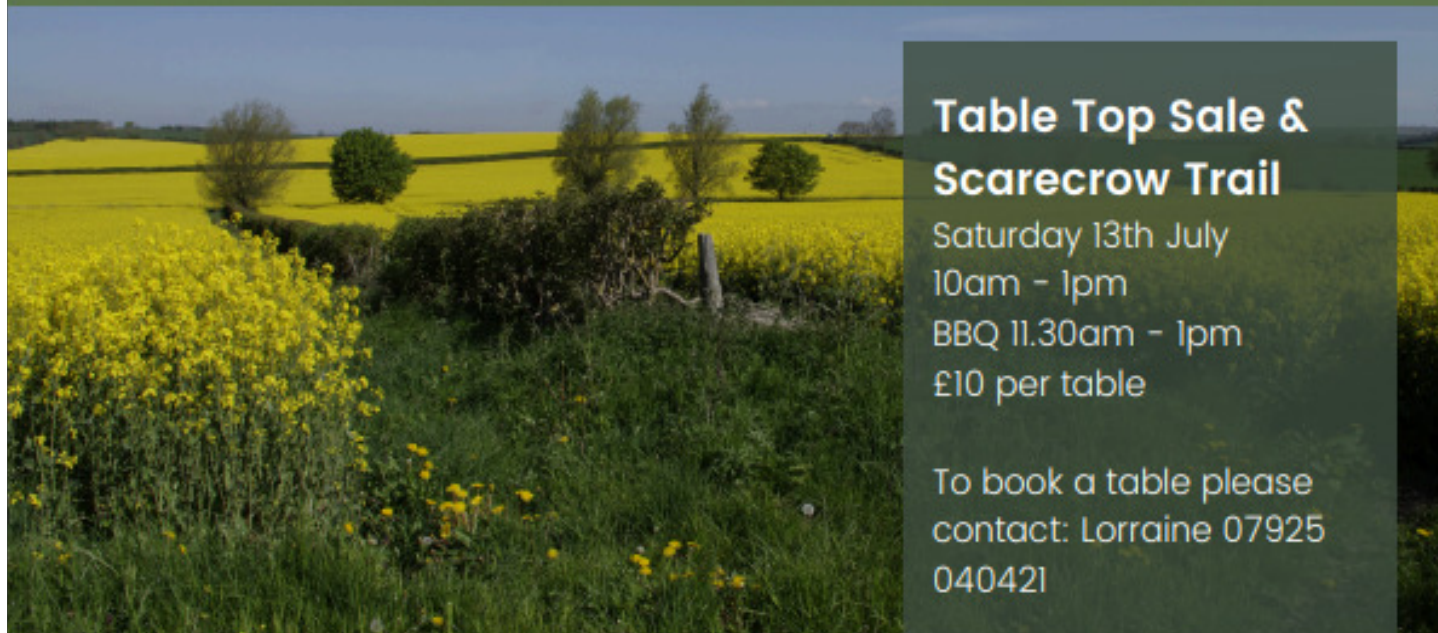
Table Top Sale & Scarecrow Trail