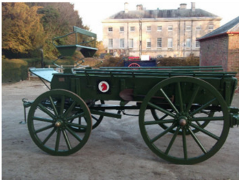
The Newly Restored General service wagon will be back in action on the day!