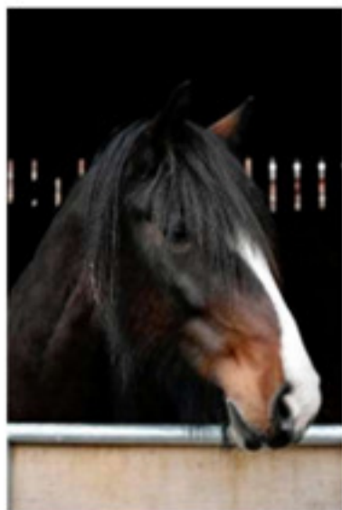
Julie, Cottage Farm Julie