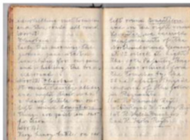
A page from the Diary.