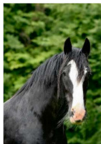
Ethan Barrowshaw Ethan,