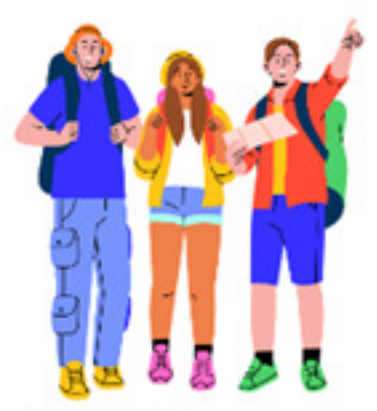
Next Walks Sunday 30th April Sunday 28th May