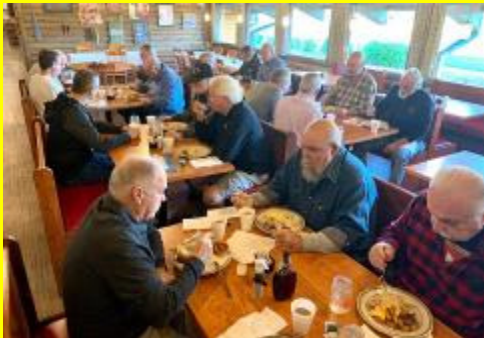
'FELLAS at FOXHOLES' Breakfast Club Saturday 25th February 9.30 till 11.00am

This is a new club which was formerly called 'Men at the Mill.' It is a Breakfast Club aimed at men to come along and enjoy a bacon sandwich and tea or coffee along with some convivial chat.