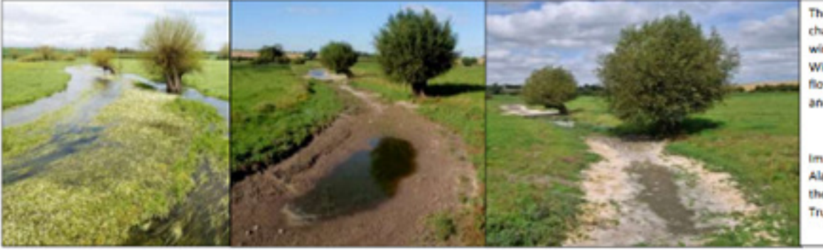
The River Till, a chalk stream winterbourne in Wiltshire, in its flowing, ponding and dry phases.

Chalk stream winterbournes are unusual compared to perennial chalk streams because they naturally fluctuate between flowing, ponded and dry phases, in response to changing groundwater levels. But how do we feel about winterbournes in those different phases, and do our moods and emotions about them change over time? How do winterbournes affect our lives, relationships, feelings, and activities near or in winterbournes over the course of a year?