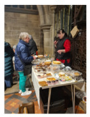
Bacon butties and cakes!