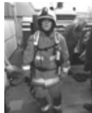
Fire Station Trip